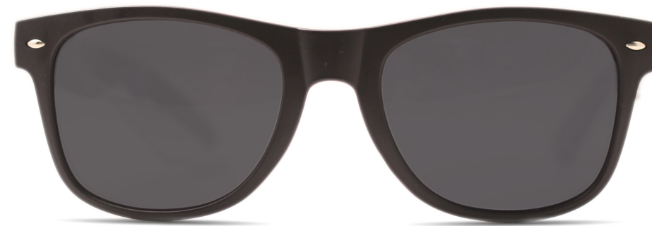
Lens: Chemistrie Color Outdoor Severe

Clip or Frame: Available as either a custom-made clip or a ready-to-wear pair of non-prescription glasses. Chemistrie Color is also available as an uncut lens for in-office finishing. Choose any frame from your board or inventory to make into a CVD solution for your patients.