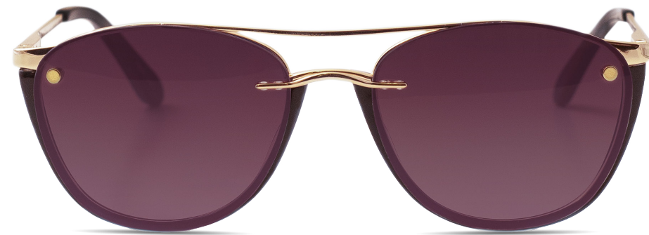
Lens: Chemistrie Color Outdoor Moderate

Clip or Frame: Available as either a custom-made clip or a ready-to-wear pair of non-prescription glasses. Chemistrie Color is also available as an uncut lens for in-office finishing. Choose any frame from your board or inventory to make into a CVD solution for your patients.