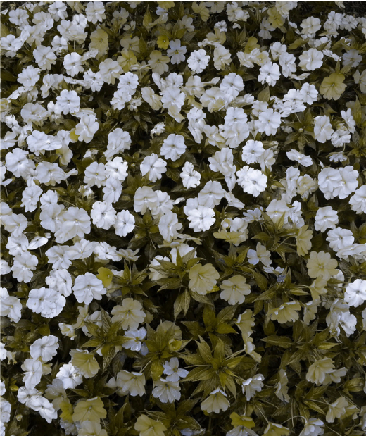
EXAMPLE OF SEVERE DEUTERANOMALY