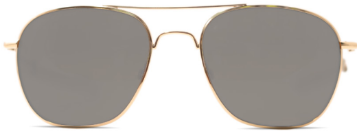
Lens: Chemistrie Color Indoor